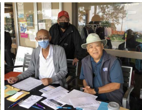
THREE GUYS AT THE REGISTRATION TABLE