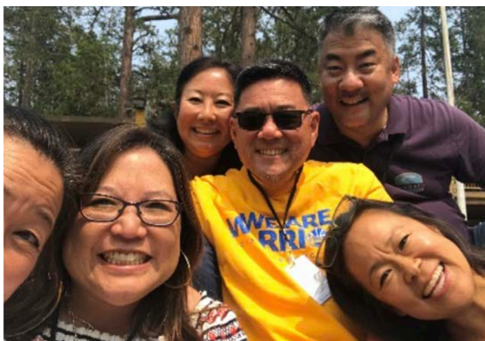
2018 MOUNT HERMON – FUN AND LAUGHS WITH THE OLD CAREER CAMP GANG!