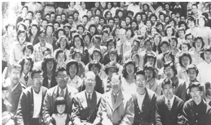
ANNUAL NISEI CHRISTIAN YOUTH CONFERENCE, MOUNT HERMON, JUNE 1950