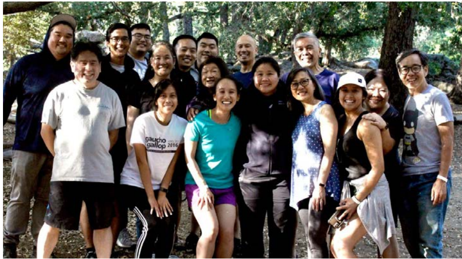
A PORTION OF AACF STAFF WHO WERE ABLE TO ATTEND POST LTC R&R.

Please pray for creativity and clarity. Next year's leadership teams are meeting right now. Some AACFs already have hosted their core retreats, a weekend focused on planning for