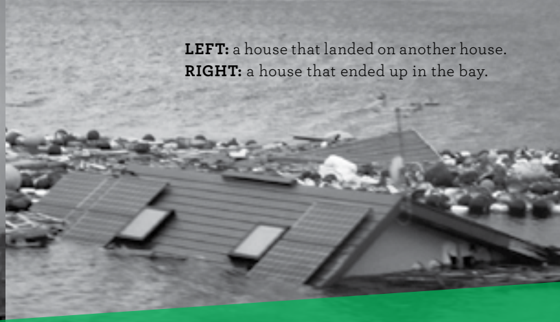
LEFT: a house that landed on another house. RIGHT: a house that ended up in the bay.