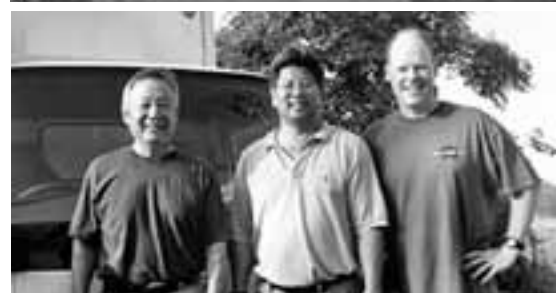
Volunteers from Ace Hardware