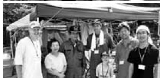
The lady lost her entire family