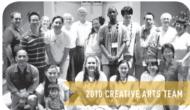
2010 CREATIVE ARTS TEAM

Our goal is to train, equip and send Creative Arts teams everywhere! <<