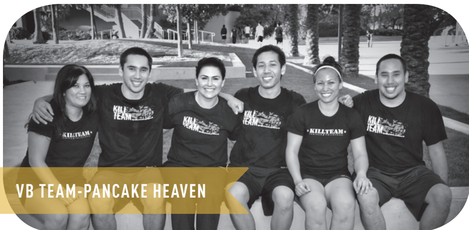
VB TEAM-PANCAKE HEAVEN