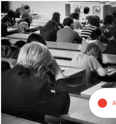
Japanese Christians praying for Japan

On March 11, 2011 The unprecedented 4th world worst and Japan's worst earthquake & tsunami hit the Eastern Japan. The Japan Headlines read: " I saw Hell", " My daily life was completely destroyed", "Children returning from school suddenly disappeared", "All family members were scattered in all directions". By March 22, Dead Persons: 9,080. Missing Persons: 12,920. Refugees: 237,085 in 46 prefectures.